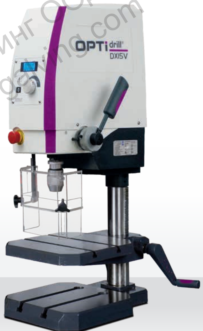
Fig.: DX 15V