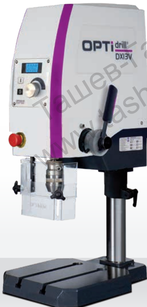
Fig.: DX 13V